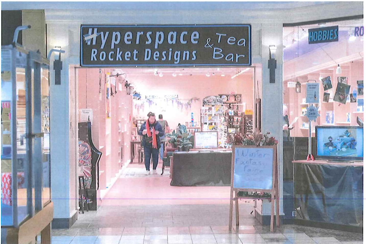
Customers wander through Hyperspace Rocket Designs & Tea Bar, which sells model rockets, model railroad supplies, specialty teas and related items.