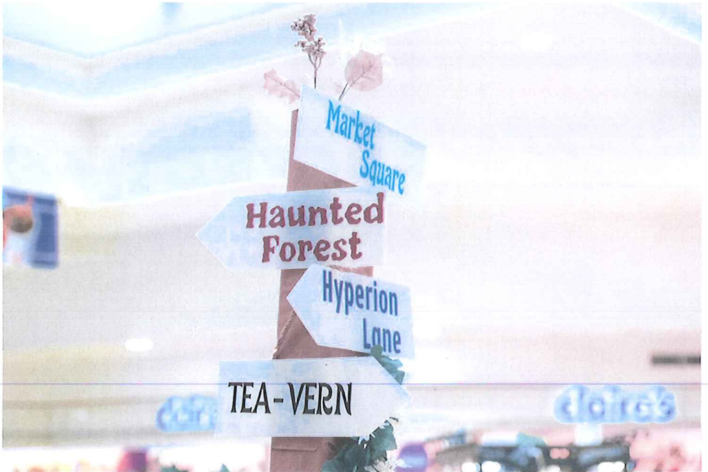
A signpost serves as a guide to visitors at Hyperspace's Winter Fantasy Faire at the TownMall of Westminster.