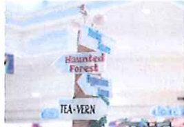
A signpost serves as a guide to visitors at Hyperspace's Winter Fantasy Faire at the Tour Mall of Westminster.