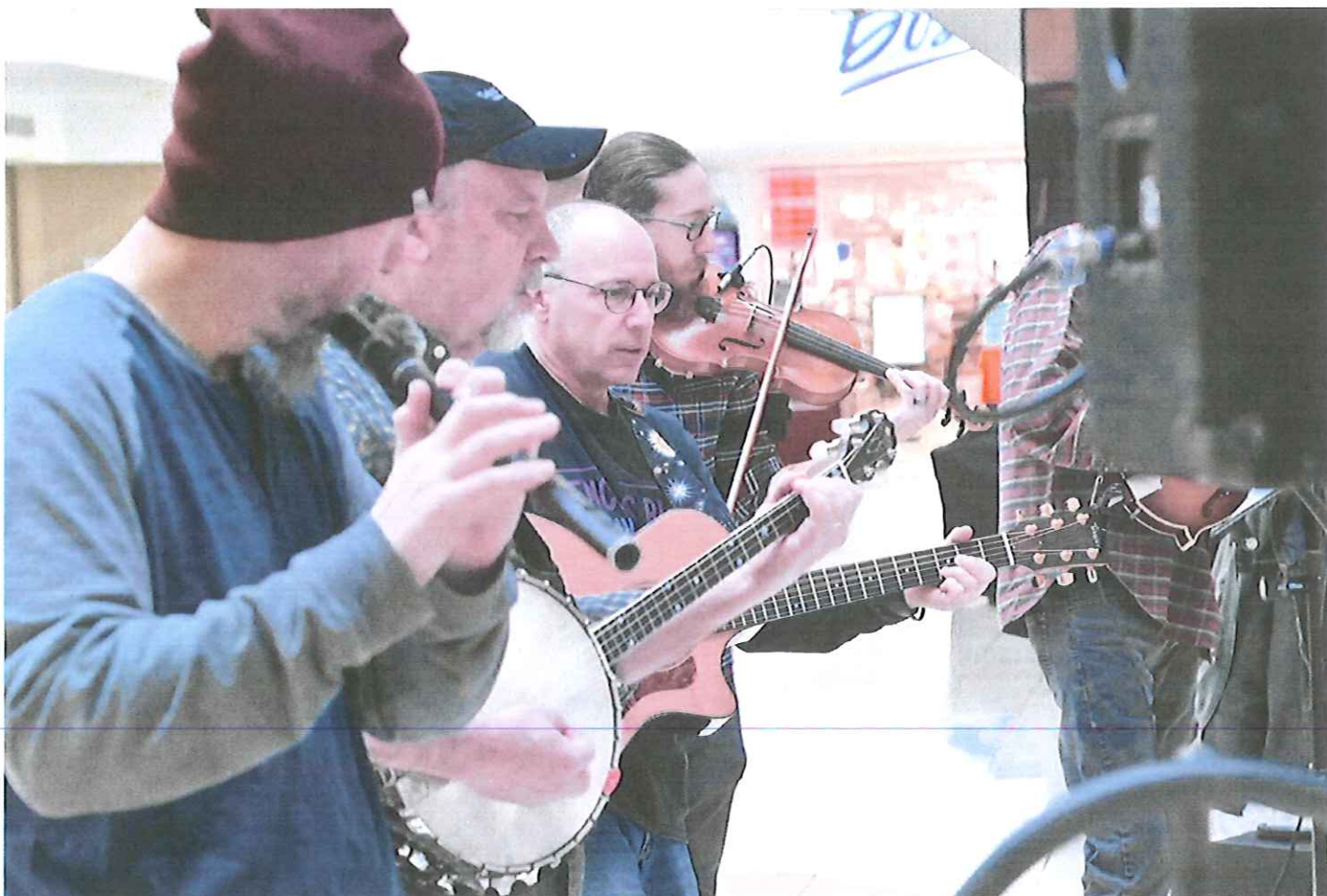
Vervan and Four Men No Dog play traditional Celtic music Saturday during the Winter Fantasy Faire.